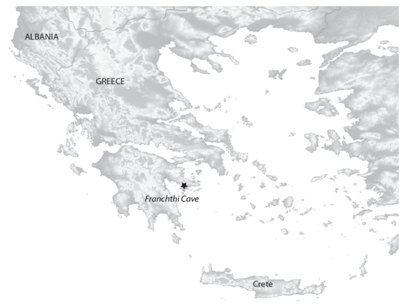
Figure 1 Map showing location of Franchthi Cave (Prepared by John Wallrodt).

such, the newly rediscovered plant impressions from EN ceramic sherds from the Paralia that are discussed here provide not only the first botanical evidence from this area of the site, but also the first EN evidence that postdates the Franchthi IN. More significantly, these impressions expand the EN range of taxa to include Triticum monococcum L. (einkorn wheat), and push back its appearance at Franchthi from Middle to Early Neolithic, a difference of several centuries.1 Prior to this new evidence, the earliest record of einkorn at Franchthi consisted of seeds and chaff (spikelet forks) recovered from Hansen's (1991) Franchthi Botanical Zone VIIa, corresponding to Vitelli's (1993) ceramic phases FCP 2.2 (Trench FAS) and FCP 2.3 (Trench FAN) and dating to the second phase of the Middle Neolithic.