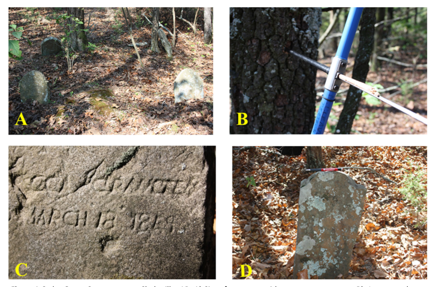
Figure 1 Cedar Grove Cemetery near Clarksville, AR. A) Site of cemetery with gravestones present. B) Increment borer used to sample trees on or near gravesites. C) One of the few gravestones (GS 12) with writing; the date is difficult to decipher but information from historical documents made it possible to verify the date as 1859. D) This gravestone was covered with the two specimens of lichen identified.

creek flows towards the former site of a large trading post on the Arkansas River, in use several decades before the acquisition of the Louisiana Purchase (Key 2001).