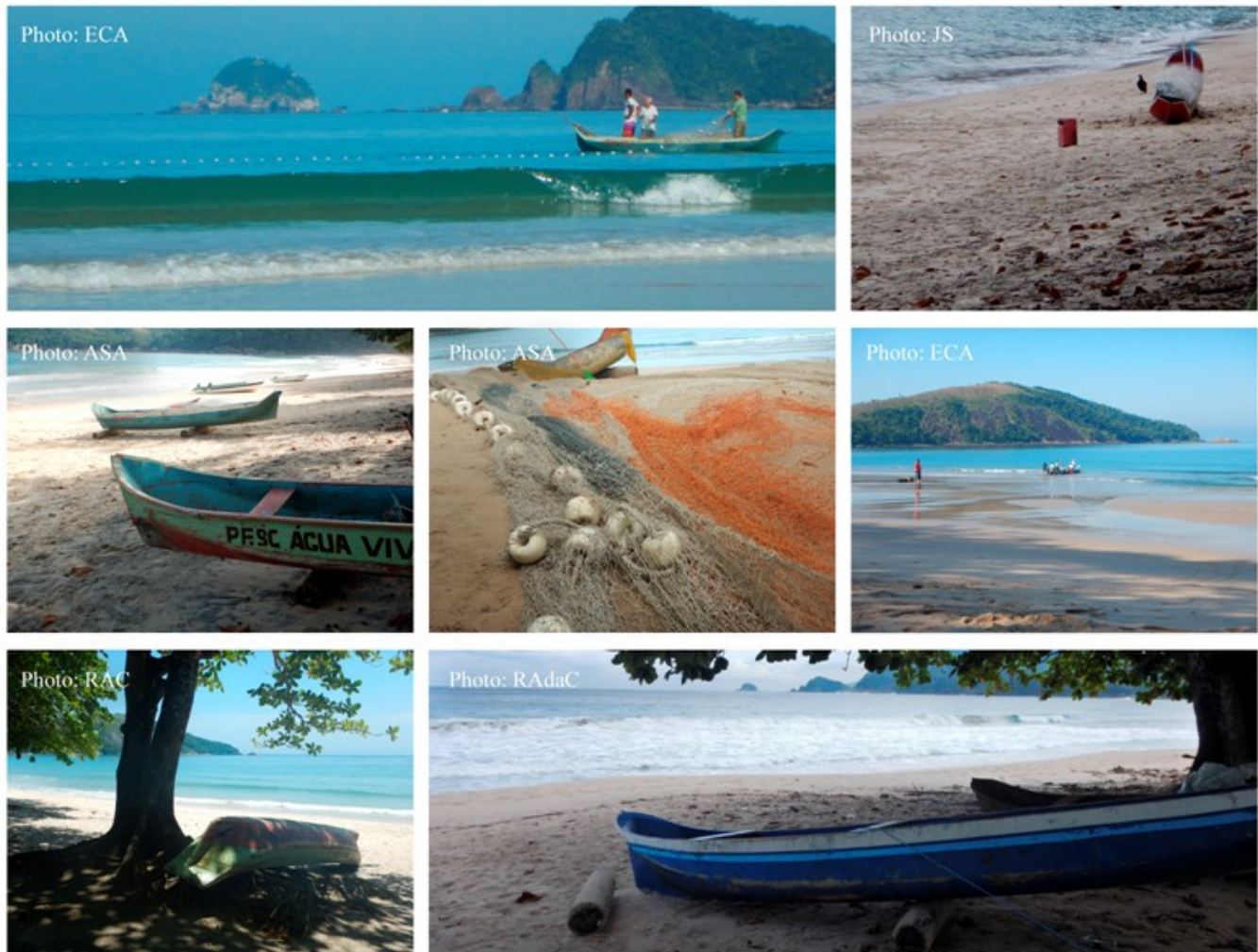
Figure 1 Photos of canoes taken by photovoice participants of the Praia do Sono community in the Juatinga Ecological Reserve (2015–2017).

and it is probably the most impacted community by tourism expansion in the Reserve. Participants were selected based on the following factors: (1) time living in the community or around the Reserve (at least 10 years), (2) willingness to take part in this research, (3) interest in photography, and (4) interest in talking about conservation. The participants were asked to take photos in response to the research question: What do you understand as conservation? Photos were then used to guide individual interviews with participants. The word “canoe” was the second most cited ( n = 254 ) in the photovoice process, surpassed only by the word “community.” From the 44 photos chosen by participants to prompt photovoice interviews, seven photos portrayed canoes (Figure 1). Participants used these photos to talk about the cultural significance of