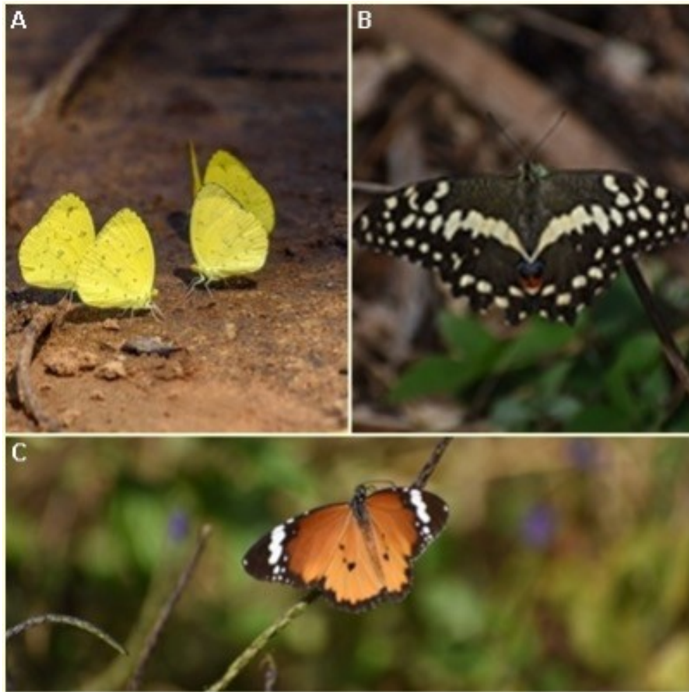
Figure 5 Butterfly species often mentioned in children's games. A Eurema floricola , B Danaus chrysippus , and C Papilio demodocus .