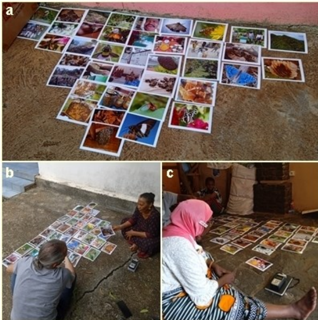
Figure 2 Data collection. A An example of Q-sort, and B , C Respondents discuss his Q-sort.

which included pollinating insects and their environment, anthropogenic threats to pollinating insects, honey gathering and modern beekeeping, honey, wax and pollen, and insect stings. Respondents were asked to rank 39 photos by preference in a forced Gaussian distribution. The photos on the right of the image (Figure 2A) correspond to preferred