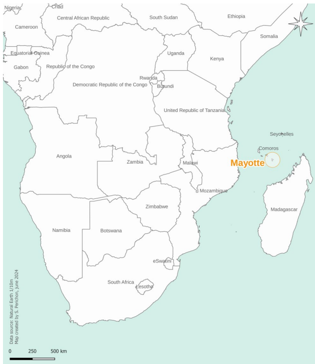
Figure 1 Geographic location of the island of Mayotte (France).

values, which inform the relationship between societies and the environment in which they develop. Traditional games, which are seen as the embodiment of customs passed down from generation to generation, are under threat due to globalization (Huizenga et al. 2017). The fact that they are often passed down verbally supports the idea that these games will be lost forever if a generation of children ceases to play them. Several countries, including Indonesia, have implemented programs to encourage children to play traditional games (Arlinkasari et al. 2020).