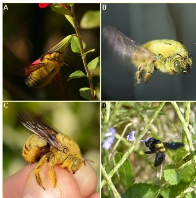
Figure 4 Xylocopa caffra (carpenter bee). A–C Male and the D female bees.

Childhood memories are triggered by butterflies and carpenter bees, and respondents often share these memories with us with emotion. The use of pollinating insects in children's play and games is no longer happening. Mango flower beetles were not mentioned, even though beetles are commonly used in children's games in other areas of the world. This Coleoptera species in Mayotte is not widely appreciated; its vernacular name can even be