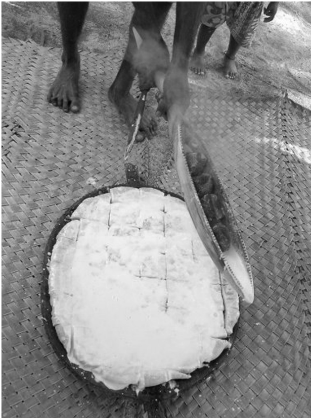
Figure 2 Nalot of breadfruit (Ureparapara, Banks Group). The large wooden spoon contains hot stones to heat the coconut milk that is poured on the paste. Note the wooden knife in the right hand of the person.

rind, the core, and the seeds are removed. The flesh is placed on a wooden plate and pounded with a pestle. Coconut milk is added and the mass thoroughly mixed. Then the pudding is laid on a wooden dish, gently hollowed with the skin of a coconut, and filled with hot coconut milk (Figure 2). In the north of Vanuatu fine wooden artifacts (platters, spoons, pounders, and long knives) were found to be associated with the preparation and eating of nalot (Huffman 1996a, b, c; Rivers 1914:81–82).