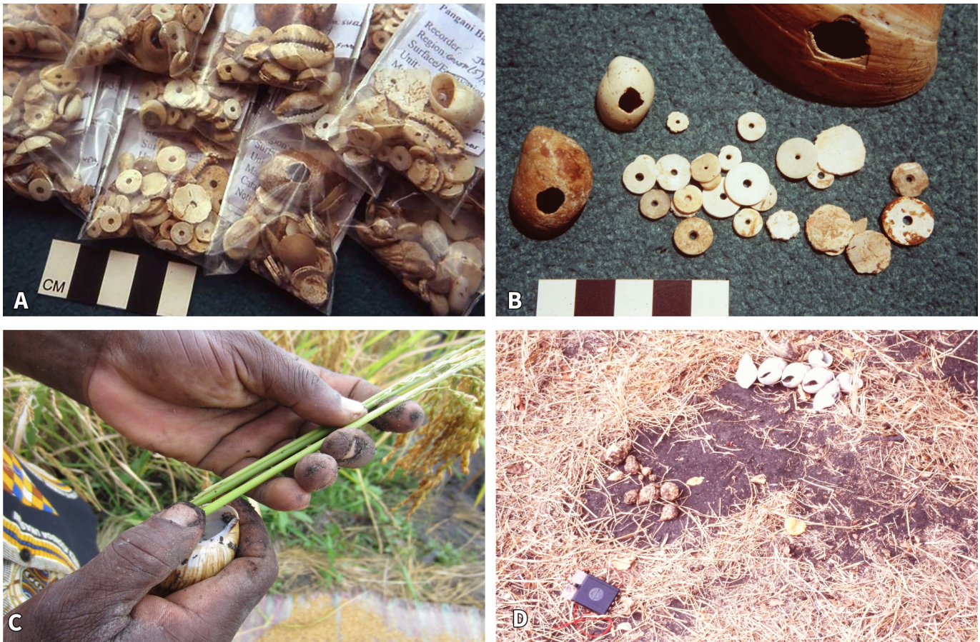
Figure 3 Uses of land snail shells, ancient and modern (clockwise from upper left to lower left): A land snail shell disc beads and marine shells and beads from archaeological contexts; B shells, bead preforms, and finished beads from archaeological contexts; C a modern land snail shell used to harvest rice; D modern shells of A. fulica employed in alleged witchcraft (cm scales or compass for scale; all photos from northeastern Tanzania).

During research in Tanga Region and eastern Kilimanjaro Region, at least one ethnographic case was observed of each of the uses of the Giant East African Land Snail or (less frequently) other land snail species listed in Table 1, either for their shells or soft parts. During structured and unstructured interviews, residents also spoke repeatedly about additional uses of land snails.