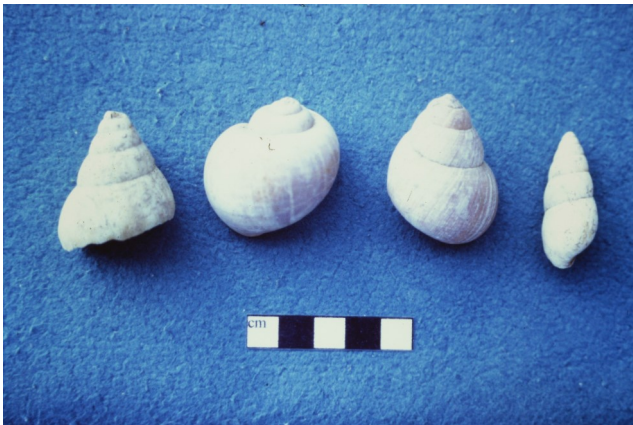
Figure 2 Land snail shell specimens excavated from Kwa Mgogo, Tanzania: (left to right) A. fulica (partial), P. ovata , L. ovum , and Limicolaria martensiana .

Mgogo (in Korogwe District, Tanga Region) and Gonja Maore (in Same District, Kilimanjaro Region), sites positioned 100 km and 175 km, respectively, from the Indian Ocean coast, yielded more than 14 kg of land snail shell, among other archaeological items. At Kwa Mgogo, based on MNI (Minimum Number of Individuals)—determined from the number of shell whorls or opercula discovered of a species—fieldwork recovered 524 land snails. Nine land snail taxa occur at the site. By weight, most identifiable specimens are Achatina spp.: likely A. fulica , also known as the Giant East African Land Snail.