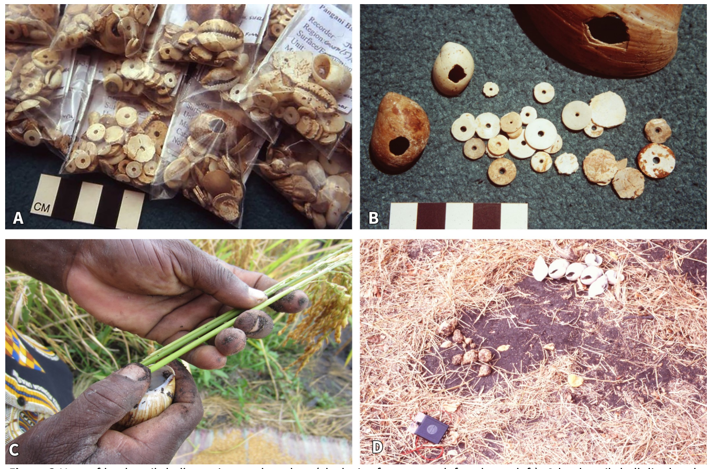
Figure 3 Uses of land snail shells, ancient and modern (clockwise from upper left to lower left): A land snail shell disc beads and marine shells and beads from archaeological contexts; B shells, bead preforms, and finished beads from archaeological contexts; C a modern land snail shell used to harvest rice; D modern shells of A. fulica employed in alleged witchcraft (cm scales or compass for scale; all photos from northeastern Tanzania).

During research in Tanga Region and eastern Kilimanjaro Region, at least one ethnographic case was observed of each of the uses of the Giant East African Land Snail or (less frequently) other land snail species listed in Table 1, either for their shells or soft parts. During structured and unstructured interviews, residents also spoke repeatedly about additional uses of land snails.