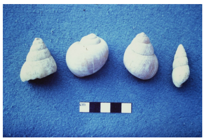
Figure 2 Land snail shell specimens excavated from Kwa Mgogo, Tanzania: (left to right) A. fulica (partial), P. ovata, L. ovum , and Limicolaria martensiana .

Mgogo (in Korogwe District, Tanga Region) and Gonja Maore (in Same District, Kilimanjaro Region), sites positioned 100 km and 175 km, respectively, from the Indian Ocean coast, yielded more than 14 kg of land snail shell, among other archaeological items. At Kwa Mgogo, based on MNI (Minimum Number of Individuals)—determined from the number of shell whorls or opercula discovered of a species—fieldwork recovered 524 land snails. Nine land snail taxa occur at the site. By weight, most identifiable specimens are Achatina spp.: likely A. fulica , also known as the Giant East African Land Snail.