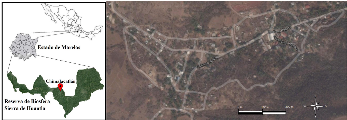
Figure 1 The study site, the village of Chimalacatlán, is in south-central Mexico, south of Morelos State.

decisions on natural resource acquisition and management (Bohensky and Maru 2011; Bohensky et al. 2013; Marques 2001). We aimed to identify potential plant and animal species that could be the focus for the future development of sustainable resource management programs.