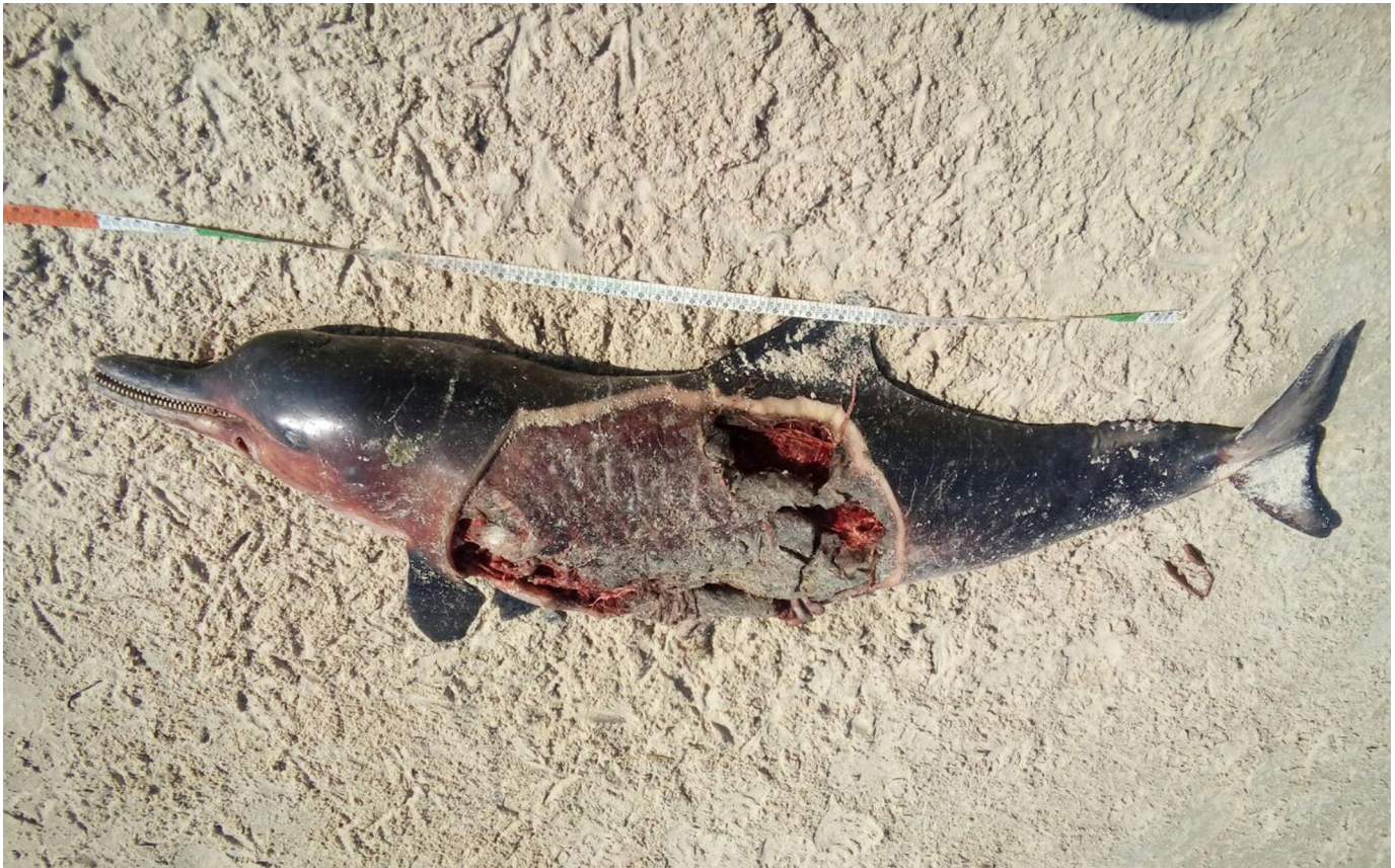
Figure 2 Guiana dolphin ( Sotalia guianensis ) carcass found in southern Bahia, showing removed fat, generally used as bait.

Canavieiras Marine Extractive Reserve, which is a federal Marine Protected Area, the project was authorized (reference #33276-1) by the National System of Information and Authorization on Biodiversity (SISBIO). At the beginning of each interview, we informed the fishermen that his anonymity would be protected.